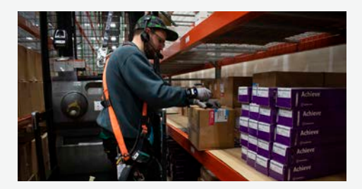
RDS software by Numina Group was integrated with the client's existing WMS (Oracle) to allow for voice picking technology.

PeakLogix integrated advanced technology to facilitate the results yielded, from pick to voice, print and apply, and accumulation conveyor.